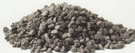
The specially treated alumino silicate substrate media bed is a key to CRP Pak's outstanding performance.

Unlike some oil/water separators that utilize gravity separation as prefiltration, CRP units need no pumps, sensors, or pre-separation filter pads. The reason CRP Paks stand alone is that the superior media bed is so efficient no prefiltration is needed. In addition, the rugged internal piping and a fail-safe decompression chamber assure proper operation. All CRP Paks contain media beds of the highest quality alumino silicate substrate, the product of a proprietary process that applies the proper quats in a particular sequence under tight quality assurance standards.